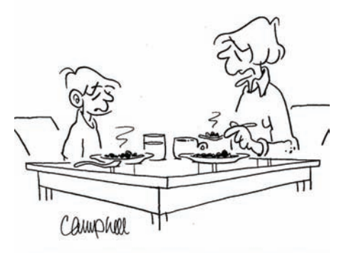
"These are vegetables, mother. You wouldn't want me to eat something I've given up for Lent, would you?"